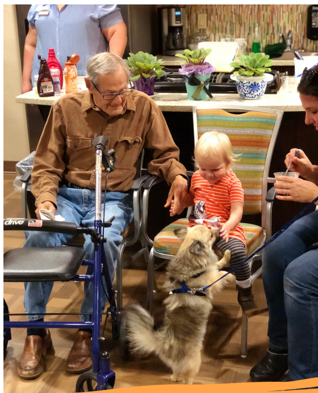
Photo: Happy Helpers Ice Cream Social September 2018

Our service projects included: creating graduation awards for children in Haiti, making Get Well cards, decorating placemats for Meals on Wheels, making dog and cat toys for the Animal Cruelty Society, making pillows for wounded soldiers, and making Christmas cards to put on every pillow at the Eugene Mission.