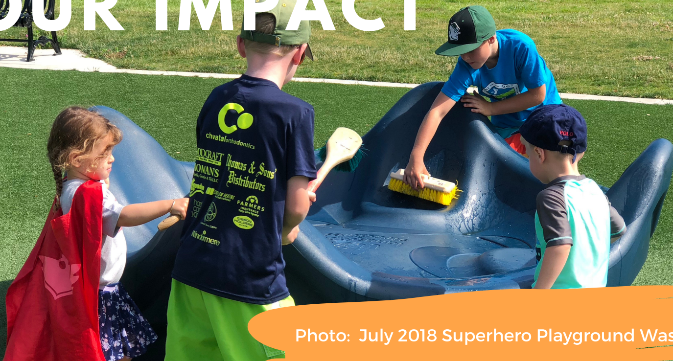
Photo: July 2018 Superhero Playground Wash

HAPPY HELPERS: In the winter of 2018, a few of the Directors of Little Hands Can were chatting with the staff at Waterford Grand, one of our partner organizations, after a particularly inspiring Happy Helpers service activity. One of the residents was a former host for an American children's television series. An aide who knows her commented that this was the most delighted and animated he had seen her since she arrived at Waterford Grand 9 months prior. Through tear-filled eyes, he said she is on hospice now and has not been very lively, but on this particular day, interacting with the children and seeing them dance to music, she displayed a joyful side of herself that he had not seen before. We all agreed that this was a beautiful and powerful reminder that little hands really can make positive and powerful change.