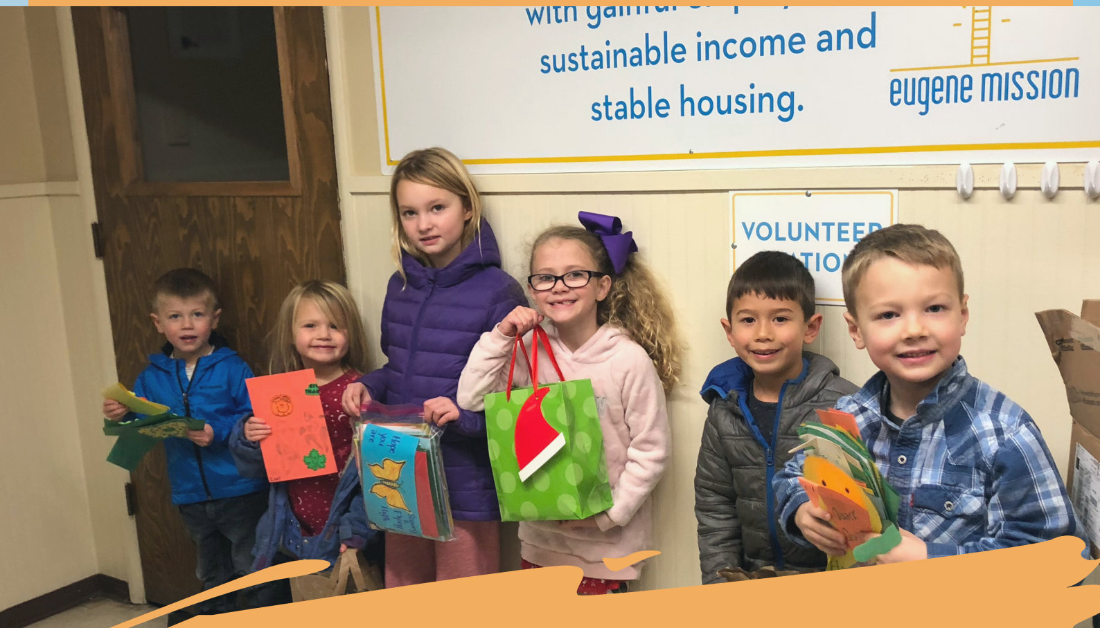
Photo: Some of our Board of Directors' Children delivering holiday cards to every bed at the Eugene Mission on Christmas Eve.