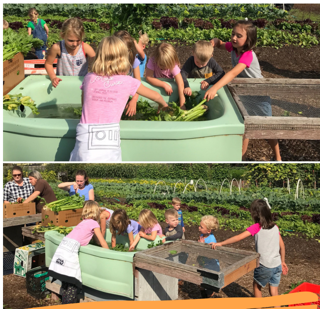
Photo: Harvesting celery in the GrassRoots Garden for FOOD for Lane County.

Our community service projects included: gardening and landscaping for the City of Eugene Parks and Open Spaces, Walama Restoration Project, Friends of Hendrick's Park, FOOD for Lane County's Grassroots Garden, cleaning and landscaping at Riverhouse Outdoor, helping the Very Little Theatre, projects benefitting animals for three local organizations, cleaning our local parks, and making ornaments for Womenspace, an organization dedicated to ending partner violence.