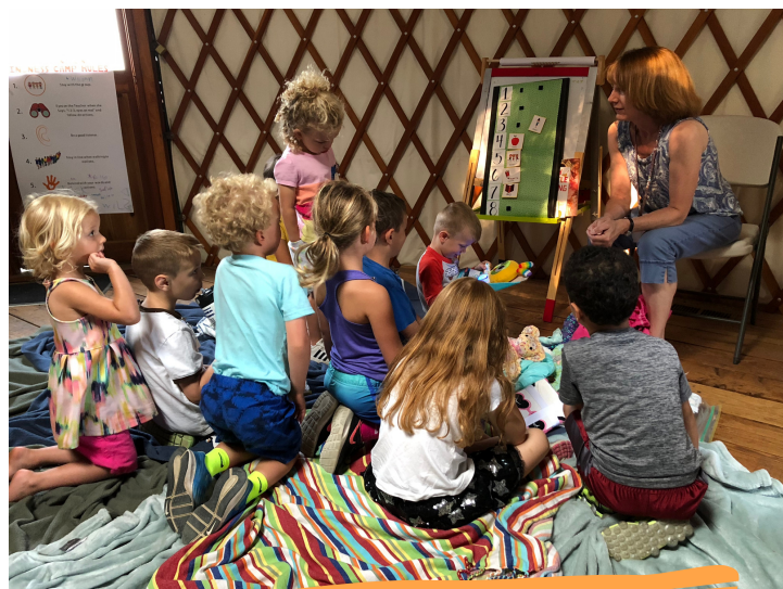
Photo: Learning about Bags of Love at Kindness Camp

We are so touched and inspired by all of the amazing volunteers, parents, and especially kids that made this week a success. Even little hands can make a big difference!