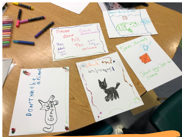
Photo: Posters to raise awareness about protecting our wildlife created by some of our After School Grow and CARE Program students.

Around 150 students are served in our LHC community service elective, and each can complete between 3 and 20 hours of service during a school year. Students benefit from the LHC Afterschool Program as they gain more confidence, self-efficacy, and tolerance as they increase their understandings of social issues. Individuals served by the local non-profits benefit, as well.